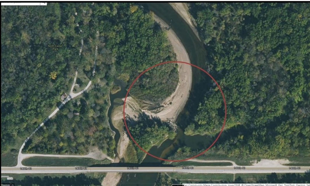
Cedar River 2023 – boat ramp on west side of the river