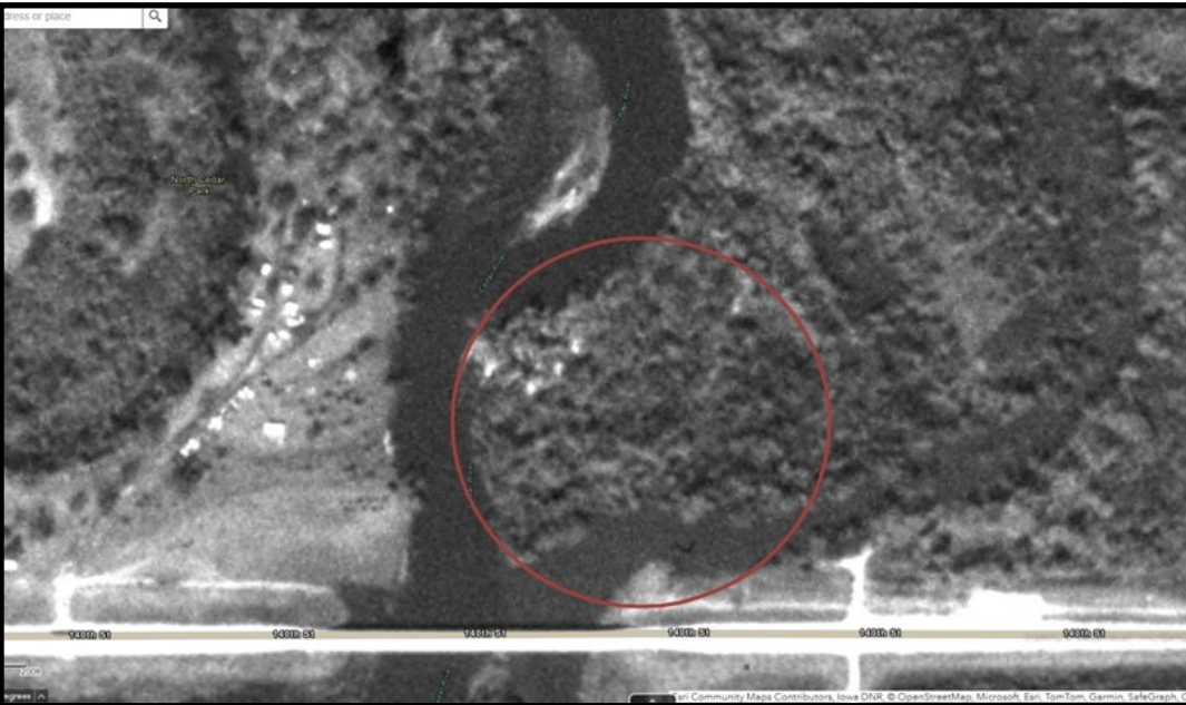
Cedar River 1980's

Below are historical images depicting how the river has changed, particularly the area within the circle.